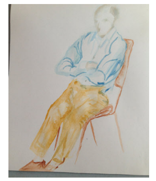
An artist's view