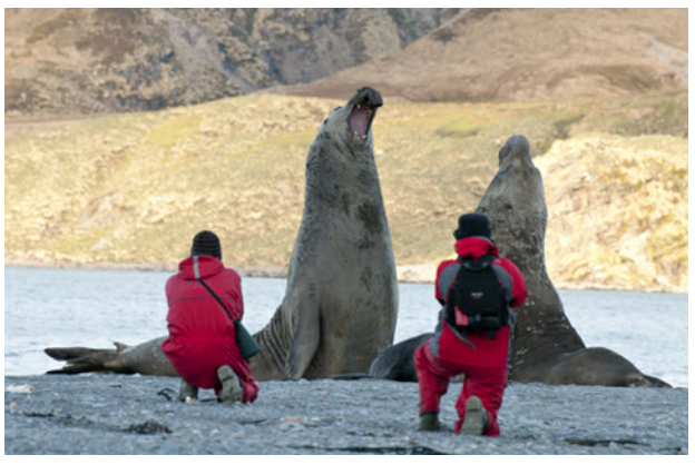
Photographing elephant seals.

close-up some amazing photographs of the indigenous flora and fauna. Whereas the Arctic is peopled and bordered / 'owned' by nations. different seven Antarctica is by international agreement an uninhabited, except for small scientific communities, 'nature reserve' and, to a large extent, protected from exploitation. Long may it remain so.