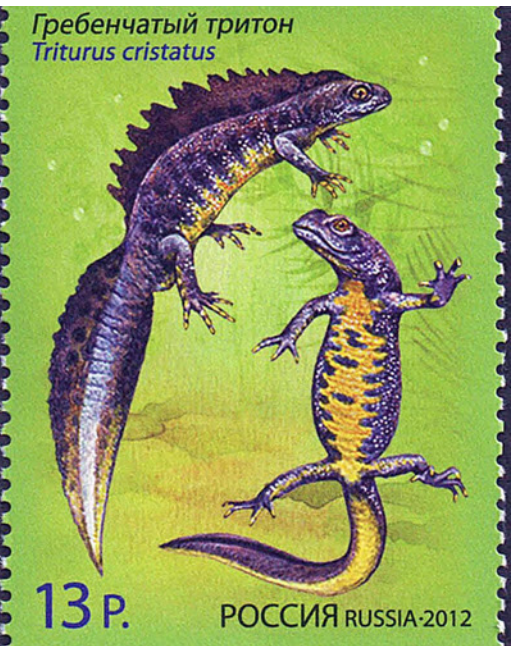
2012 Russian stamp of the Great Crested Newt

was tugging and swallowing at the same time. Every few seconds it would tug and thrash, rather like a crocodile, and seemed to be winning the contest. We photographed this unusual event and went in for our meeting. Later on when leaving there was no sign of the newt or the worm. The earthworm is part of the great crested newt's diet, along with crustacea and molluscs. Great crested newts breed and lay their eggs, 200 to 400, from March to July. The young hatch after two-to-three weeks and develop into adults after about three months The adult newts leave the ponds at the end of July into August and some will go underground or into old ditches, many will go under buildings, flagstones or wood piles, coming out to feed (as we saw with our